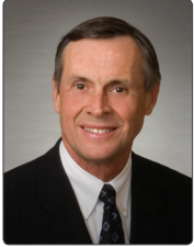
The Honourable Don Morgan Q.C.

Minister of Justice and Attorney General