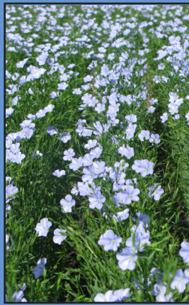
Brown Soil Zone