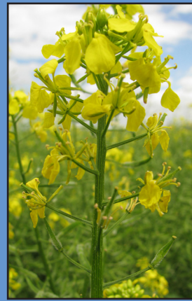
Black Soil Zone