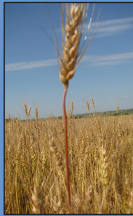
Dark Brown Soil Zone