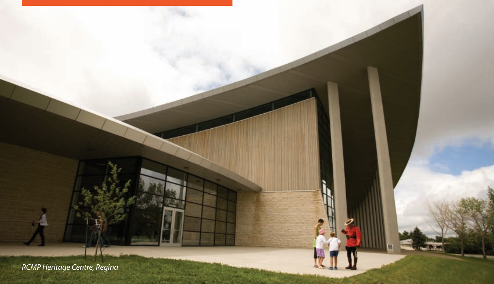
RCMP Heritage Centre, Regina

Saskatchewan has approximately 4,000 tourism-related businesses that provide full- and part-time employment to 55,600 citizens, almost 10 per cent of the working population. There are twice as many people employed in tourism-related jobs than in the mining and oil and gas sectors combined.