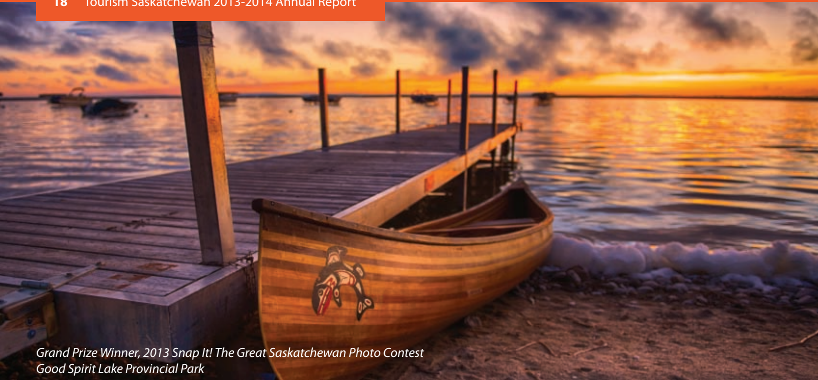
Grand Prize Winner, 2013 Snap It! The Great Saskatchewan Photo Contest Good Spirit Lake Provincial Park