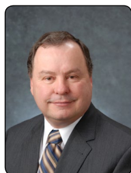
The Honourable Bill Boyd Minister of Energy and Resources

I am pleased to present the 2010-11 highlights for the Ministry of Energy and Resources.