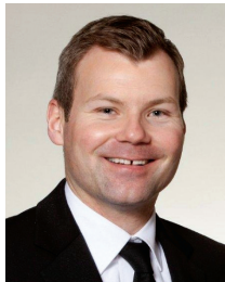
The Honourable Dustin Duncan Minister of Health