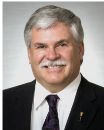
The Honourable Randy Weekes Minister Responsible for Rural and Remote Health

This annual report highlights document provides an executive summary of the Ministry of Health's 2012-13 annual report and additional information about significant achievements in the health system.