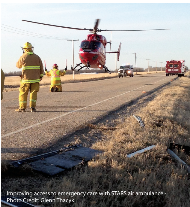
Improving access to emergency care with STARS air ambulance

The Saskatchewan healthcare system works together with you to achieve your best possible care, experience, and health.