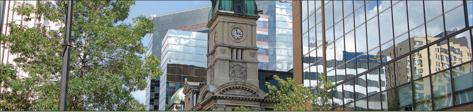
Downtown Regina