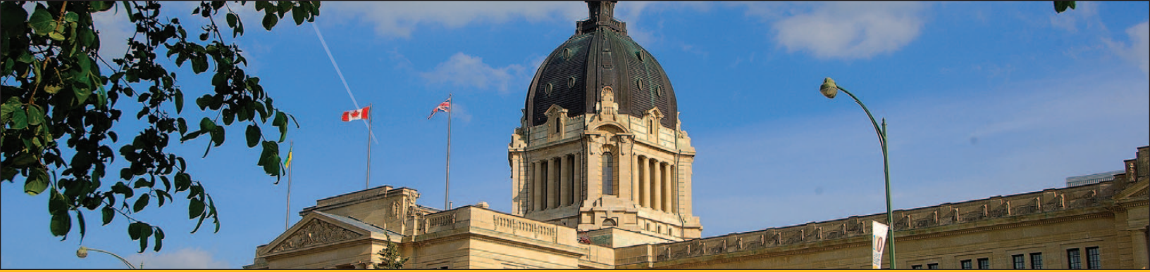
Photo Credit: Tourism Saskatchewan, Hans-Gerhard Pfaff, Saskatchewan Legislative Building