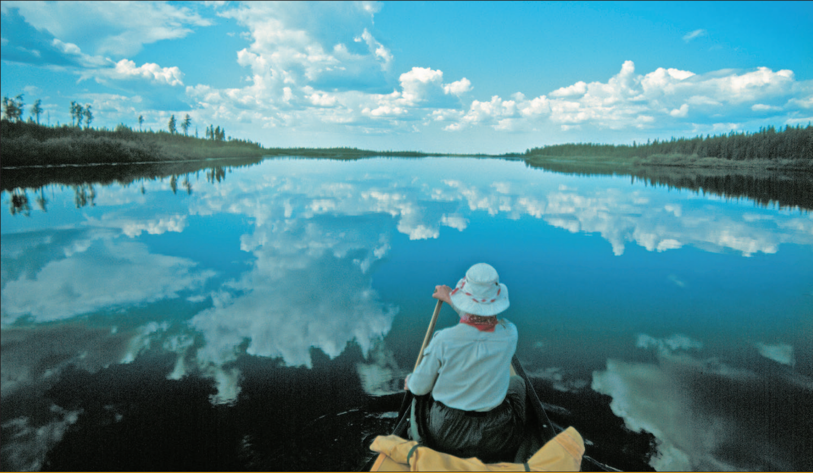
Photo Credit: Tourism Saskatchewan, David Buckley, Canoeing, MacFarlane River