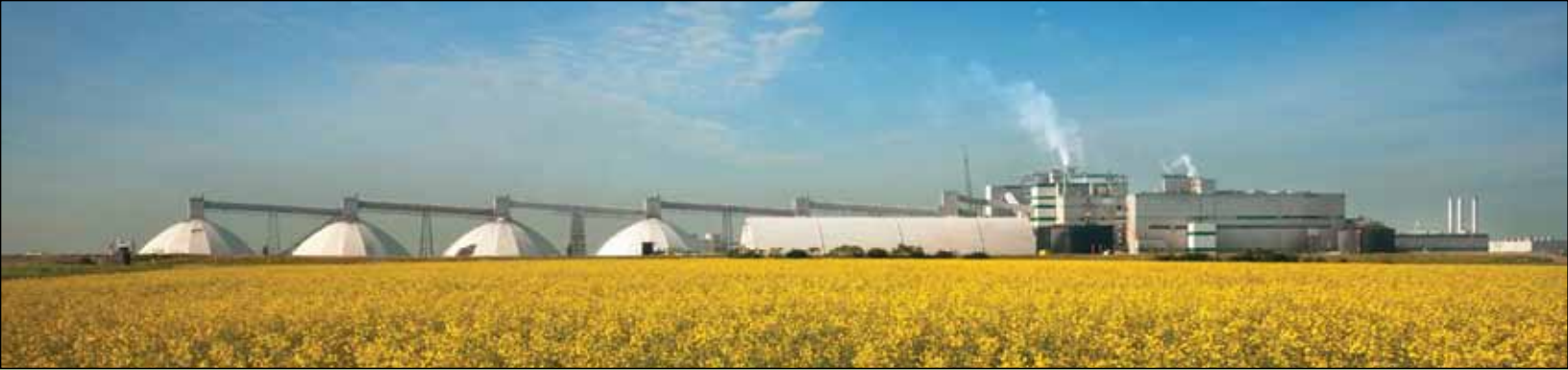
Mosaic Belle Plaine site