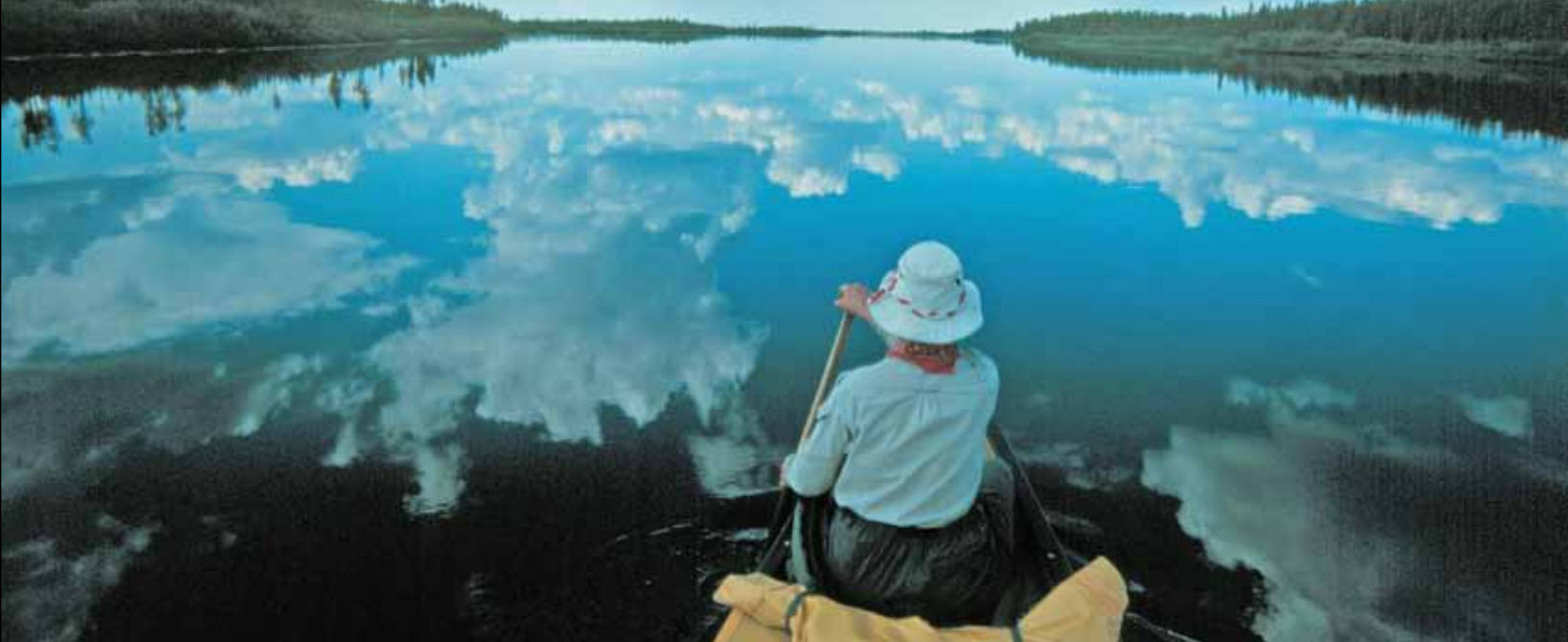
Canoeing, MacFarlane River