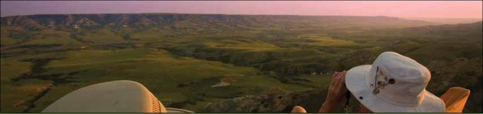
Jones Peak, near Eastend