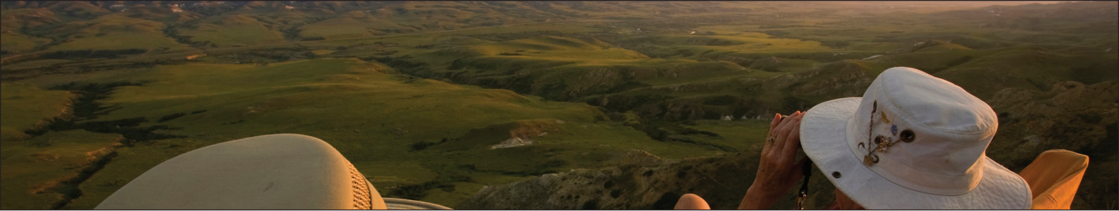
Jones Peak, near Eastend

The Education Act, 1995 directly delegates responsibility for specific aspects of education to the Minister of Education and for other aspects to boards of education. Many factors influence student performance and require the Ministry and the education sector to work collaboratively with other partners such as the ministries of Health, Social Services and Justice, to address complex issues.