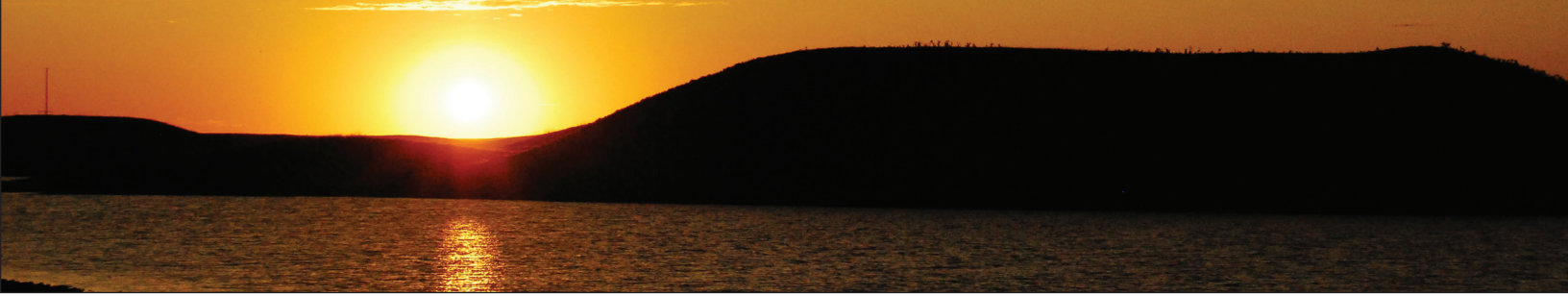
Rafferty Reservoir