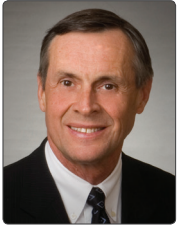
The Honourable Don Morgan, Q.C. Minister of Education

I am pleased to present my Ministry's Plan for 2014-15. The Government's Direction and Budget for 2014-15 are built on the principle of Steady Growth to support a continued focus on sound economic growth and shared prosperity. In this plan we identify how the Ministry of Education aligns with this direction and supports the Saskatchewan Plan for Growth.