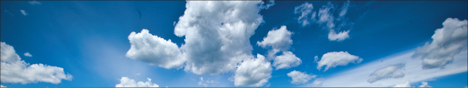
Blue Sky over Duck Mountain