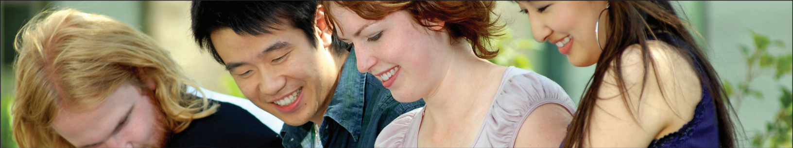
Photo Credit: Ministry of Advanced Education, Employment and Immigration