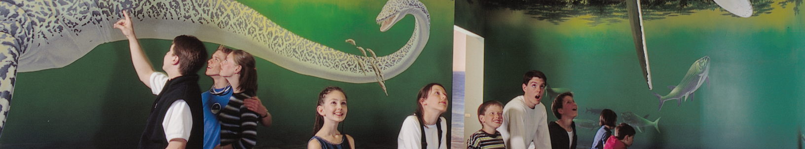
Mosasaur at the RSM