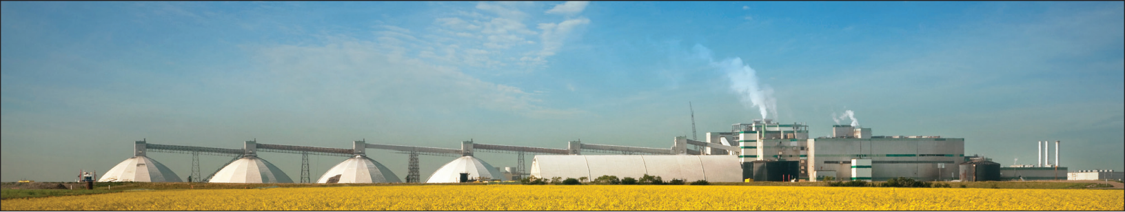
Mosaic Belle Plaine site