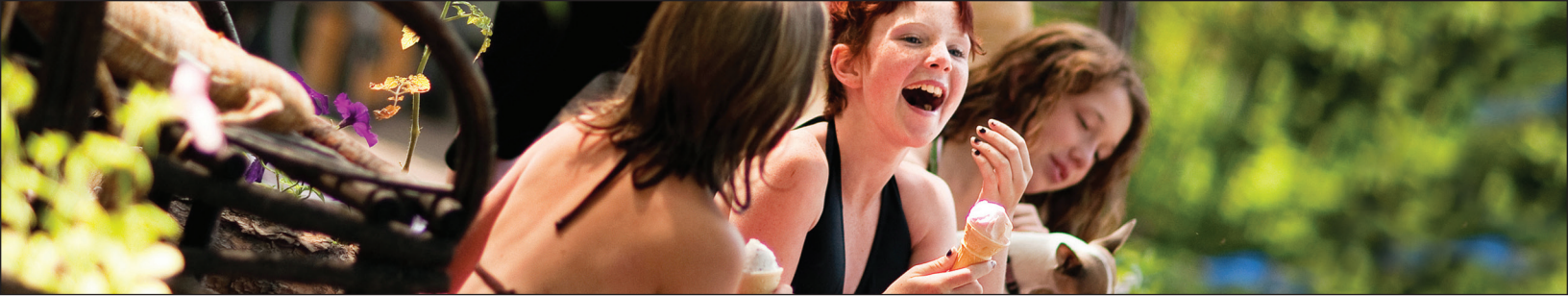
Photo Credit: Ministry of Parks, Culture and Sport, Greg Huszar Photography, Nesslin Lake Campground

The Education Act, 1995 directly delegates responsibility for specific aspects of education to the Minister of Education and for other aspects to boards of education. Many factors influence student performance and require the Ministry and the education sector to work collaboratively with other partners such as the ministries of Health, Social Services and Justice, to address complex issues.