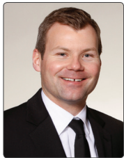
The Honourable Dustin Duncan Minister of Health