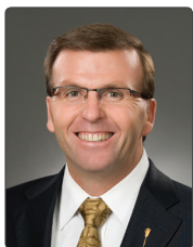
The Honourable Greg Ottenbreit Minister Responsible for Rural and Remote Health

We are pleased to present the Ministry of Health's 2015-16 Plan.