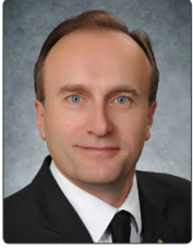
The Honourable Jim Reiter