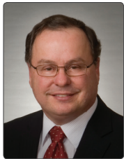
The Honourable Bill Boyd Minister of the Economy