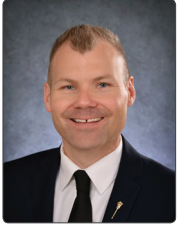
The Honourable Dustin Duncan