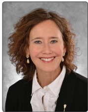
The Honourable Bronwyn Eyre