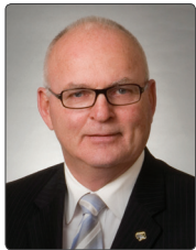
The Honourable Lyle Stewart Minister of Agriculture

I am pleased to present the Ministry of Agriculture's Operational Plan for 2018-19.